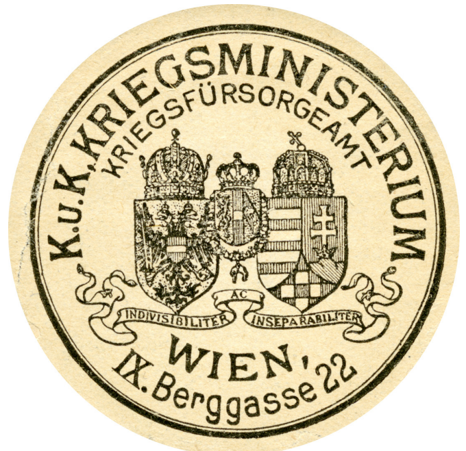
Fig. 7. Official paper seal from Ministry of War. Shading with dots and lines properly denotes colours by heraldic rules.