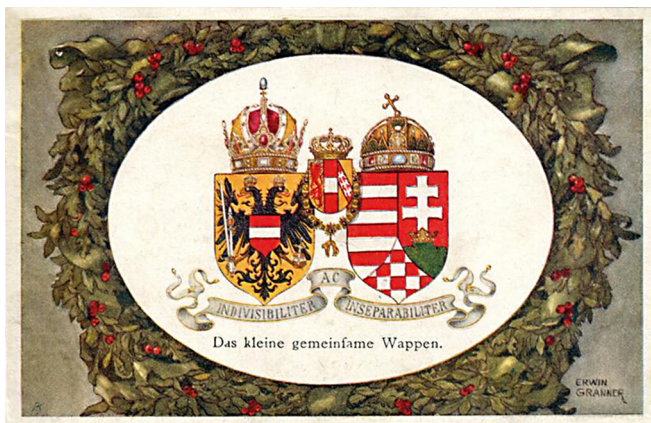
Fig. 6. Artist patriotic card by Erwin Granner, 1916